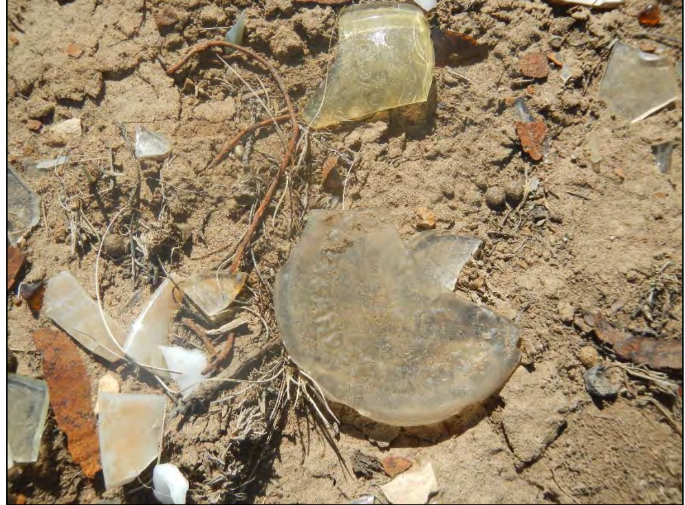
Figure 11: LA 179150 Site Overview Facing South (top) and Glass Artifacts (bottom).