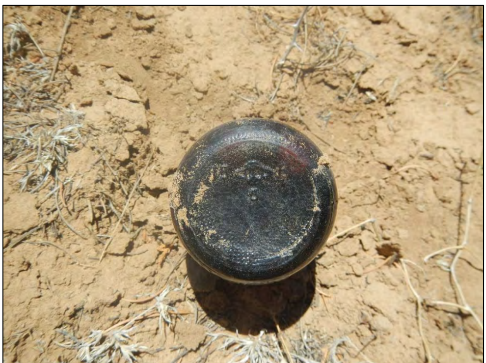
Figure 9: LA 179149 Feature 5 Facing Southwest (top) and Owens Illinois Maker's Mark (bottom).