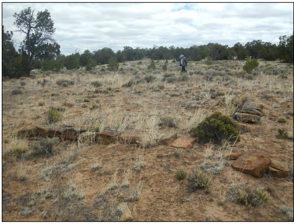
Figure 13: LA 179150 Woman's Boot (top) and Feature 1 Facing Northeast (bottom).