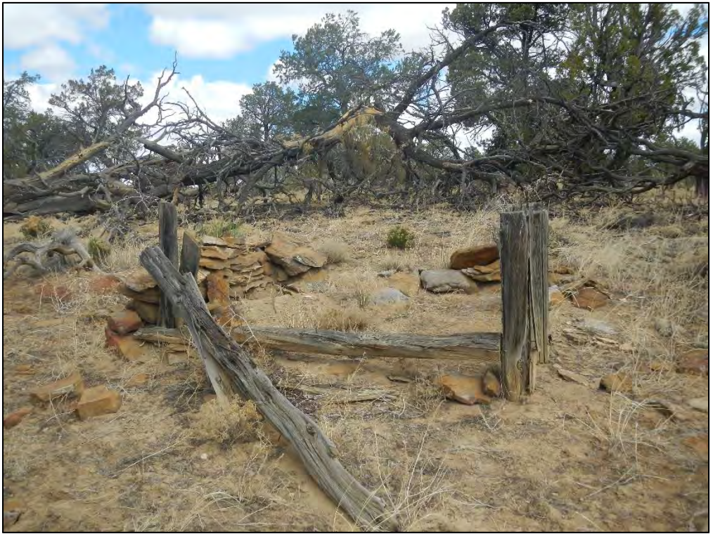
Figure 8: LA 179149 Feature 4 Facing West (top) and Facing Southwest (bottom).