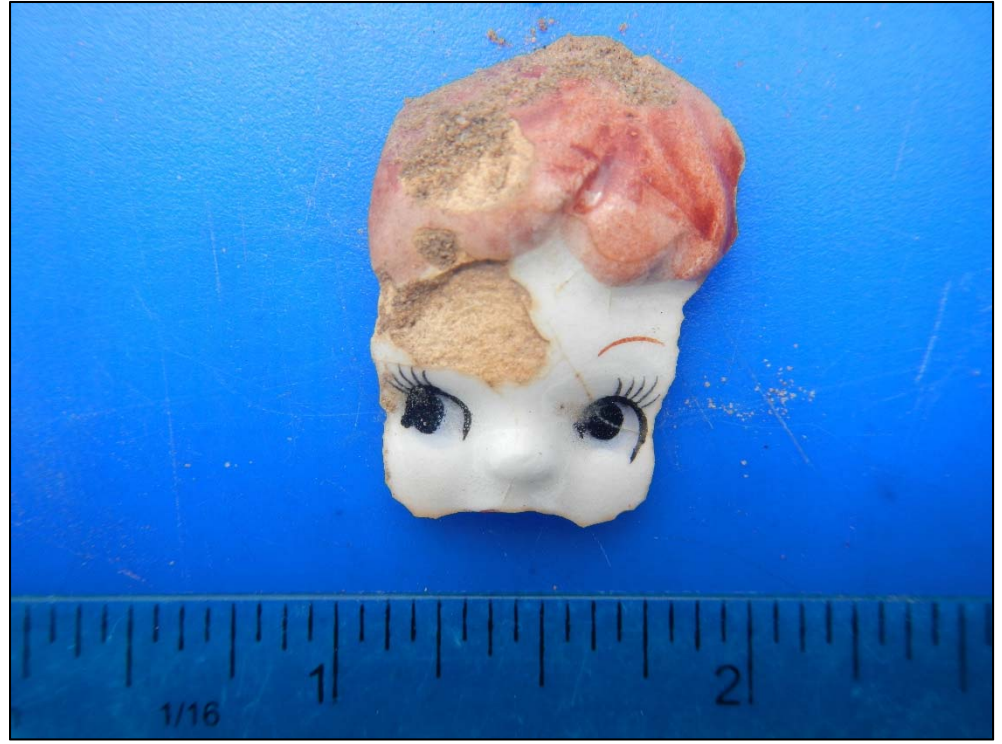
Figure 12: LA 179150 Small Doll Face (top) and Painted Doll Head Fragment (bottom).