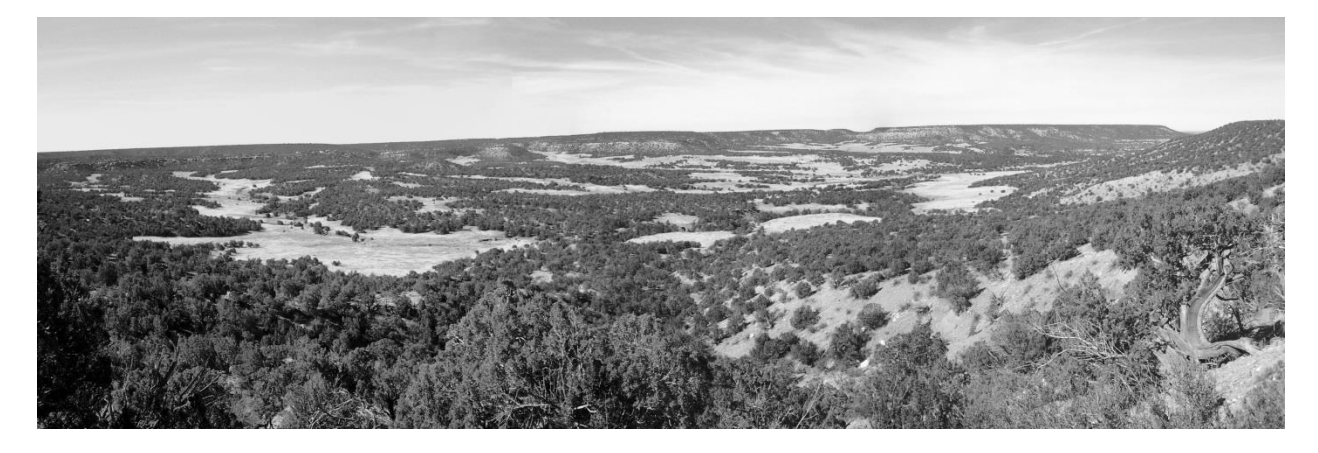
Figure 1 – Upper Rincon Hondo Canyon

The Cox Ranch was established by Robert L. "Bert" and Anna S. Cox in the 1920s and eventually grew to include approximately 140 sections of private and leased land. A portion of the ranch included land in the region of Rincon Hondo Canyon where cow-calf operations were conducted. A regional map, including well locations, is included as Attachment 1. The upper canyon where well 10A-5-W06 is located is as pictured in Figure 1.