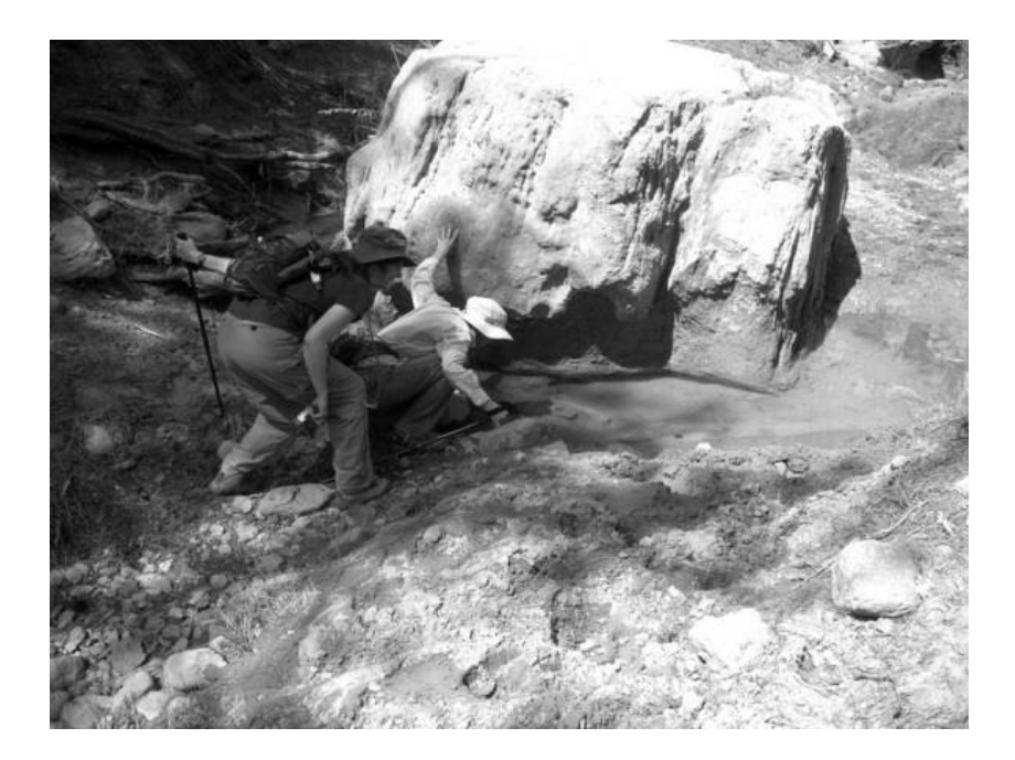
Figure 9 – Zuni Spring

The Zuni Spring was also represented as a potential water source for the Rincon Hondo Canyon regional herd in the summer. No drinkers were present and water would pool on the ground (Cox Dep. 43:5-10). As shown in Figure 9, very little water is associated with Zuni Spring and no water right was assigned to this source under the Zuni Basin adjudication.