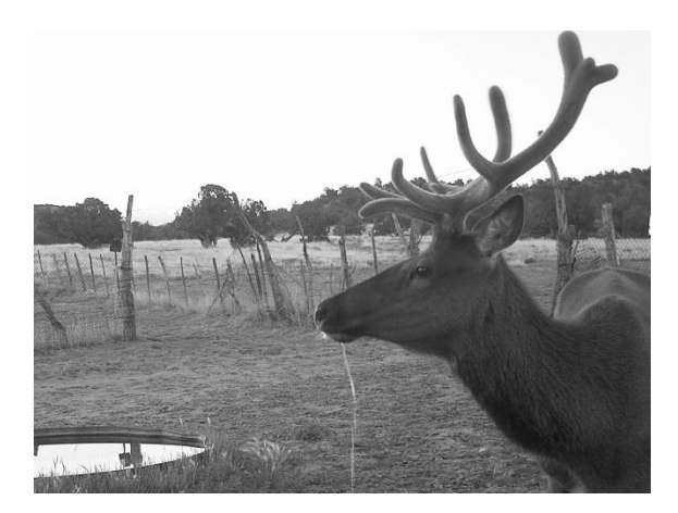
Figure 20 - Consumptive Water Loss

Cattle drink with their heads down, drawing water in and then swallowing. Cattle and other ungulates can be observed raising their heads during this process allowing water to spill from the sides of their mouths, Figure 20. While some of this water will spill back into the drinker, some is lost to the ground. Additional loss mechanisms during drinking include adults using their hooves to break ice and young animals entering and exiting the drinkers, Figure 21.