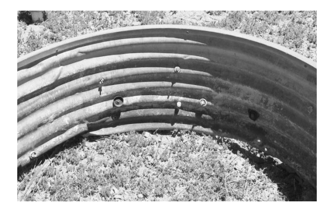
Figure 24 – Prior Repairs to Drinker

Evidence of previous leaks and repairs is readily observable at the well site; Figures 25 and 26 represent examples. Failure of the concrete is associated with freeze-thaw cycling, frost heave and weathering of the concrete itself. The main holding tank is known to be a significant and unmitigated source of leakage as evidenced by standing water below ground level in the main storage tank valve box, Figure 27. Valve stem packing failure and aging piping and fittings contribute smaller amounts to the chronic leakage total as well.