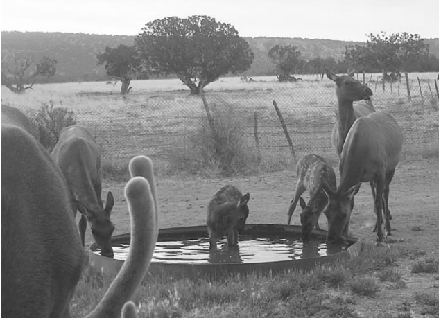
Figure 21 – Splashing Water Loss

No data has been found that provides the basis for assigning an efficiency rate to the