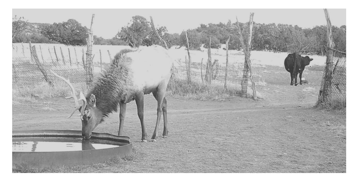
Figure 22 – Cattle and Wildlife Share the Water Source

As described above, cattle made use of water withdrawals from well 10A-5-W06 throughout the year, drinking a calculated 815,802 gallons per year at an annual average of 2,689 gallons per day. Extrapolating from recent observations, wildlife would have made use of water during the entire year as well, Figure 22 (also see wildlife discussion below).