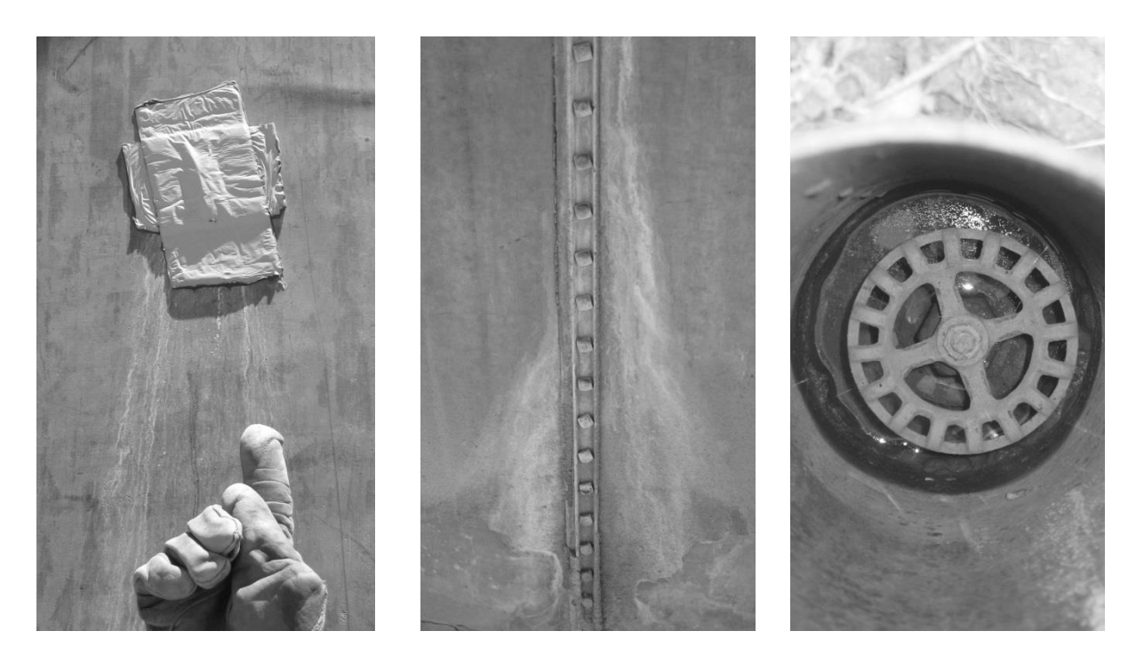
Figure 25 – Storage Tank Leak

The cumulative effect of chronic leaks for the well 10A-5-W06 infrastructure can be determined by observing the rate of water level drop in the 10-foot tall, main holding tank. Based on my observation, the water level drops approximately one foot per week. Subtracting evaporation and wildlife usage, the system leakage rate appears to be at least 0.1 gpm. The historic annual loss of water due to chronic leaks is projected to have been 52,560 gallons.