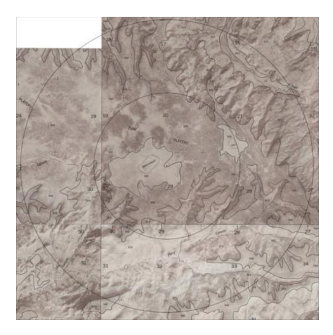
Figure 13 - Sheets 70, 71, 87 and 88 of 102

The SCS soil survey is supplemented by 102 detailed maps of the region. Sheet 71 of 102 includes Section 29, Township 5N, Range 19W N.M.P.M., the location of the High Lonesome Well; the surrounding sections of land are included on sheets 70, 87 and 88. Figure 13 is a scanned image of relevant portions of Sheet 70, 71, 87 and 88. To determine the acreage of land associated with each of these two soil units, the scanned image shown in Figure 13 was