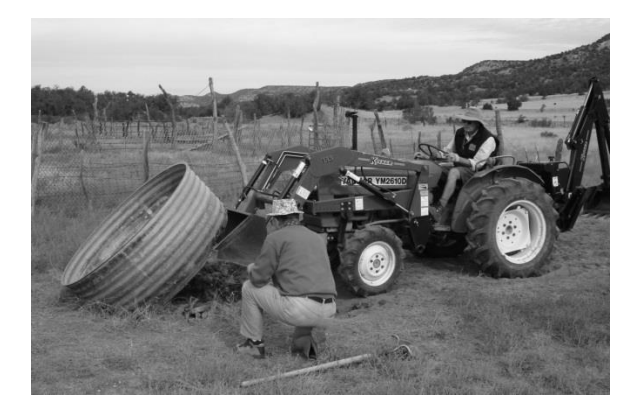
Figure 23 – Removal of Leaking Drinker

Other chronic losses are associated with leakage through the concrete bottoms of the holding tank and water troughs as well as from leaks associated with interconnecting pipe fittings and valves. Infrastructure at the well 10A-5-W06 location was 45 years old in 2000 when last used significantly for livestock watering purposes. To reduce excessive leakage, the Defendants have replaced or repaired the concrete bottom of two tanks, three times in the past ten years. The Defendants removed one water drinker in 2007 to mitigate these kinds of losses (Figure 23). Despite Tom Cox testimony that he didn't recall any leaks (Cox Dep. 75:14-20), Figure 24 shows at least seven leak repairs in this drinker as well as corrosion failure at the base.